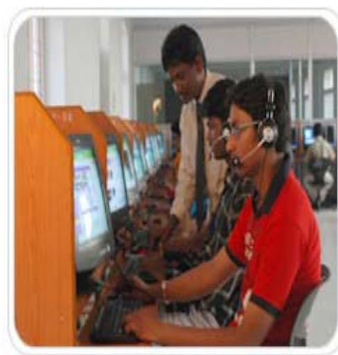
ENGLISH COMMUNICATION SKILLS LABORATORY